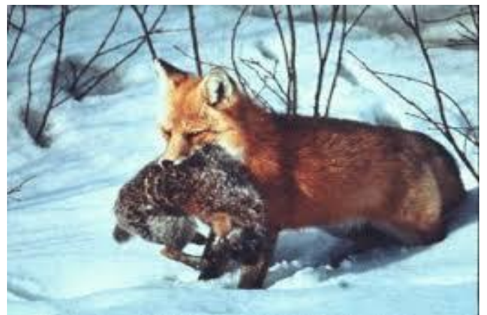
Figure -2: Prey predator examples